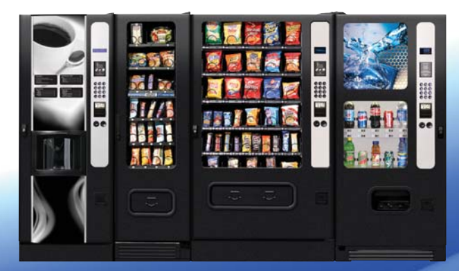
Full Line Vending Products & Services

Dispense a broad menu of premium & specialty beverages.